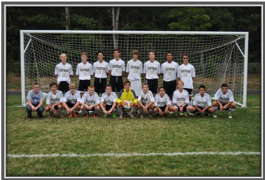
2016 SRHS BOYS RESERVE SOCCER TEAM